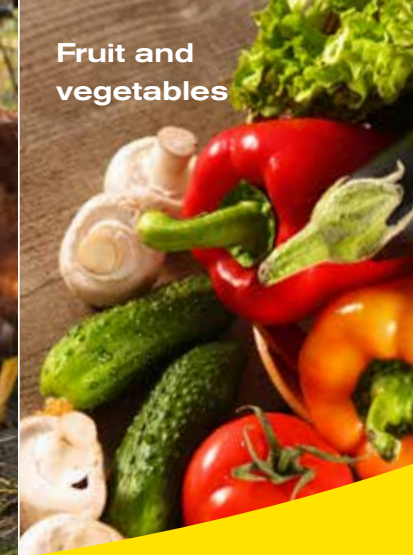
Fruit and vegetables