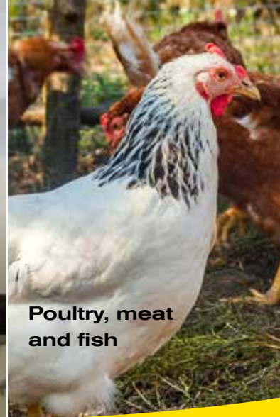
Poultry, meat and fish