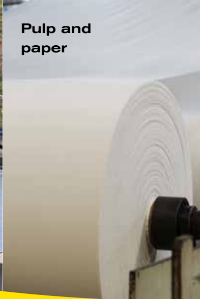
Pulp and paper