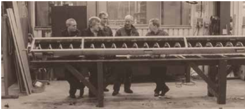
Lackeby Products AB has more than 60 years of experience in designing and manufacturing the Lackeby Screw conveyor.

With our long experience and in-house manufacturing of all the vital parts of the screw conveyor we are a reliable and appreciated partner for all types of installations of screw conveyor systems.